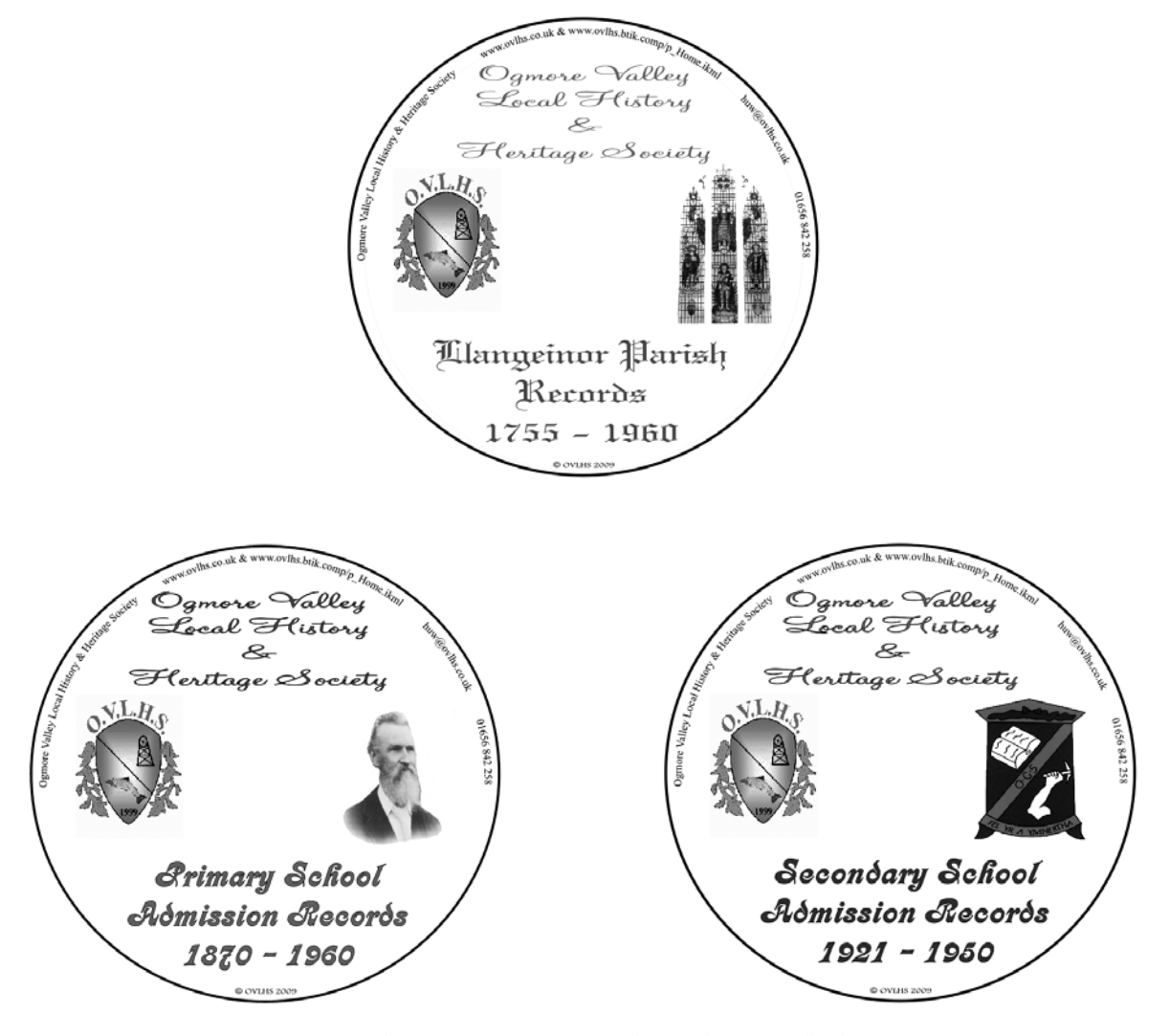
Primary Source Data DVDs Available from the Society

Finally, we would gladly like to see you at our meetings as everyone really is welcome, no matter what age, though we do ask if your planning a bus load to let us know in advance, though we do appreciate that for many of our readers this may be physically impracticable, though you may be with us in spirit. However wherever you are in the world, you can still help by perhaps submitting an article of your own or perhaps suggesting a topic for a future article so that we can carry on recording the valleys heritage in our Journal which is the envy of many society's and with all your support will continue to go from strength to strength.