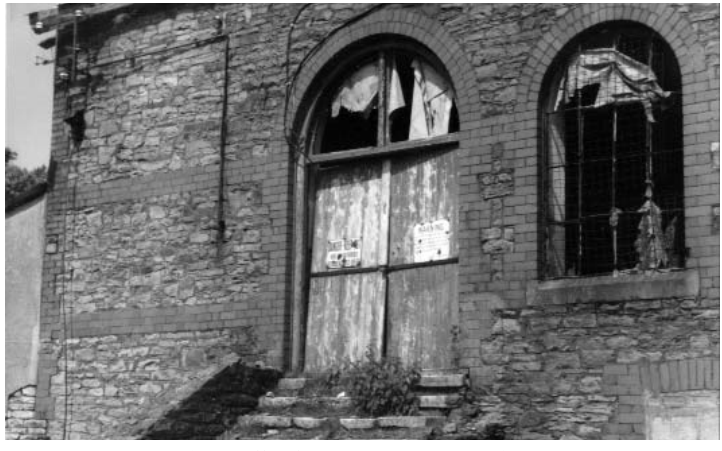
Aber Colliery Fan House c.1980

In the setting of the constitution and deciding the aims of the Society it was clear very early that the Society shouldn't just exist to research and publish annual Journals based on the members submissions, but that the Society should take an active part in preserving the history & heritage of the Ogmore Valley for future generations but too much is lost.